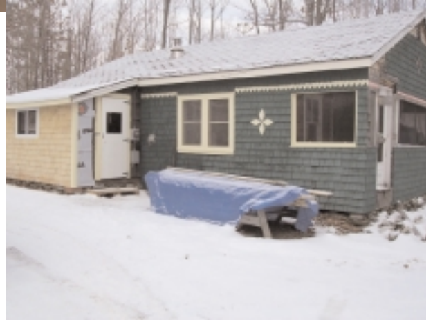
Photos from the new Guest Cottage